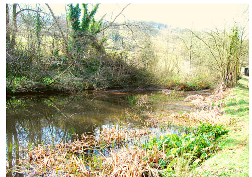
Silted up pond, Aisholt (before photo)

If you have a project idea please visit www.quantockhills.com/greater-qu-landscape-development-fund or contact Iain Porter at the Quantock Hills AONB Service on 07977 412077 or iporter@somerset.gov.uk where we will be happy to discuss your project idea and guide you through the application process.