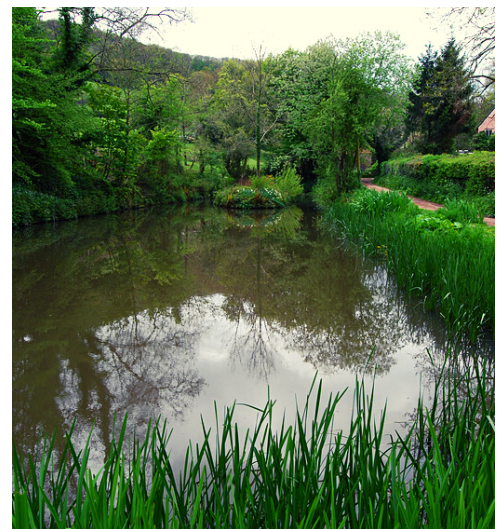
Restored pond, Aisholt (after photo)